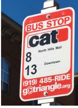
Transit Passenger Amenities

During the program year, funds were used to support transit planning activities and expenses related to staff positions as well as the preventive maintenance of fleet, vehicle replacement, replacement radios and shop tools, and bus shelter equipment. Tasks completed by transit planning staff included research and development of the unified planning work program and transportation improvement program, monitoring and updating Title VI and environmental justice plans, and annual collection of transit system data needed for national transit reporting and for safety and security reporting. In addition, long range planning elements were developed for the Capital Area Transit System. These include financial, population, and employment forecasts. These funds also provided support for transit planning efforts associated with student populations.