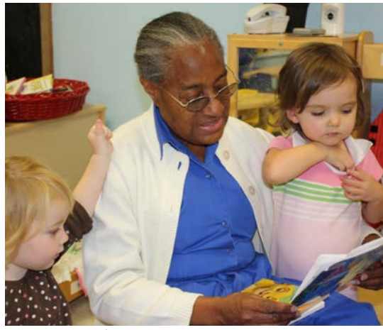
Foster Grandparent Program

During the program year, 81 volunteers served 62,304 hours. Foster Grandparents serving in an afterschool program assisted two children in meeting the academic goals outlined in their assignment plans. Grandparents in the elementary education program assisted 70 children, of which 95% showed improvement in the areas of math, literacy, and appropriate social behavior. Grandparents in pre-elementary school programs assisted 31 children with delayed motor skills, inappropriate social skills and/or delayed developmental skills; 90% showed improvement in their identified areas. In an additional program focused on developmentally disabled children, four children served by grandparents showed improvements in speech, language, motor and emotional development.