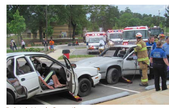
Raleigh Youth Council