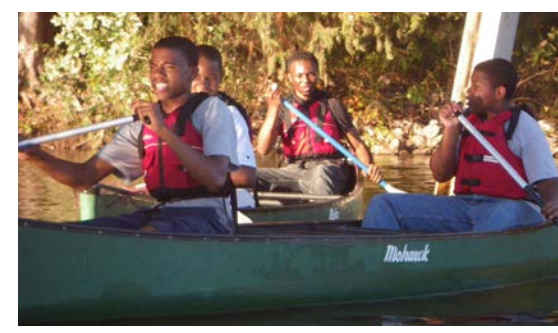
Teen Outreach Program

This grant supported construction of the House Creek Greenway, which follows House Creek along the I-440 beltline between the Crabtree Creek Trail at Crabtree Valley Mall and Reedy Creek Trail at Wade Avenue. The greenway allows users to traverse the city by connecting the Walnut Creek greenway system and the Crabtree Creek greenway system.